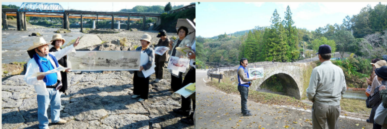
(Pictures taken on-site at the first review and re-examination in 2017)

37. Goto Islands (Shimogoto area) Geopark