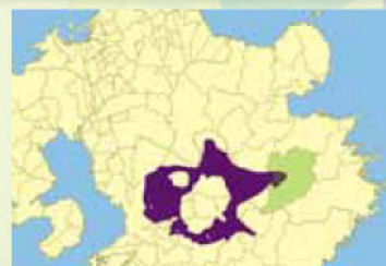
Volcanic explosion about 270,000 years ago

In the past, Mt. Aso had four major volcanic explosions. We can understand the size of the pyroclastic flow during each explosion by observing the Aso ignimbrite.