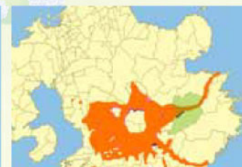
Volcanic explosion about 120,000 years ago