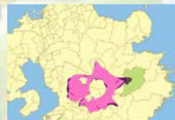
Volcanic explosion about 140,000 years ago